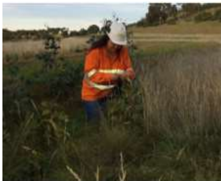
Above: staff member assessing revegetation in one of our SEB offset areas

Hillgrove Resources is proud to be a major sponsor of the Callington A&H Show. We are mindful that we are working alongside other local landowners and as part of a local community. It is our greatest wish to see everyone benefit from the mine's life-cycle.